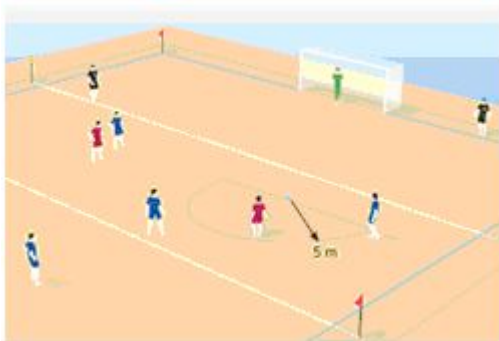
Direct free kick in opponent's half